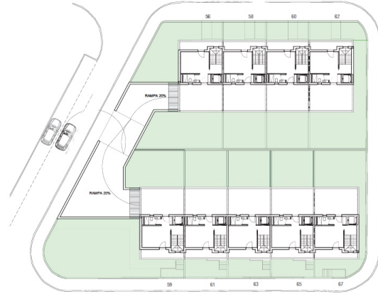
PLANTA SEGONA ↻