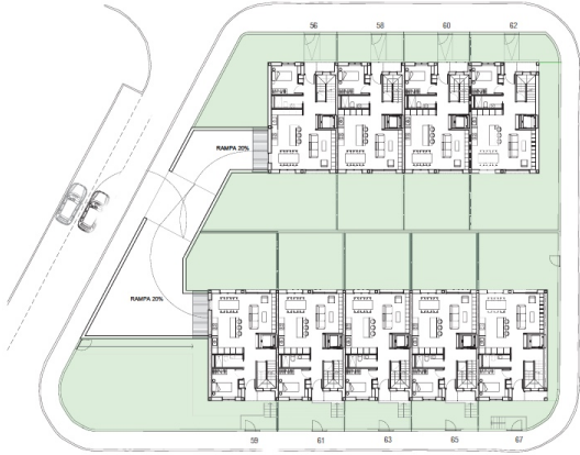
PLANTA BAIXA ↻